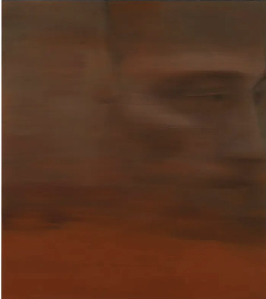
Two officials oversee Chernobyl's catastrophe, 2025 Oil on canvas 51.2 x 45.3 in. / 130 x 115 cm

“It is as if erasure were the only way to combat the emotional amnesia that history can engender: we are moving towards abstraction, but something resists. A face.”