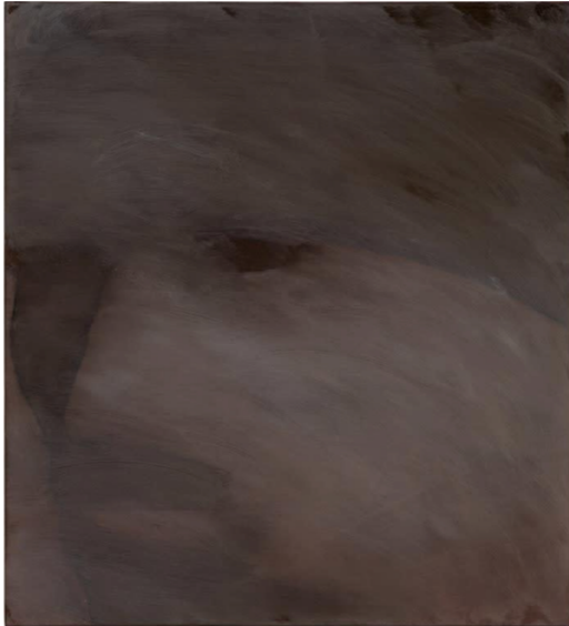
Invasion of Finland, 1939 Russian Prisoner, 2025 Oil on canvas 29.5 x 26.8 in. / 75 x 68 cm

"I cannot paint oppressors or the oppressed in a neutral way. One does not paint a Nazi prisoner like any other subject. Black and white is a conscious statement. The statuesque, symmetrical treatment of the lines, for example. There is also a sense of respect in indicating what one is looking at and where it comes from. My titles are often very descriptive, scientific: "Russian Prisoner in 1944". These are very serious images. In a way, it is a response to today's geopolitical events, and thus an attempt to prevent history from repeating itself."